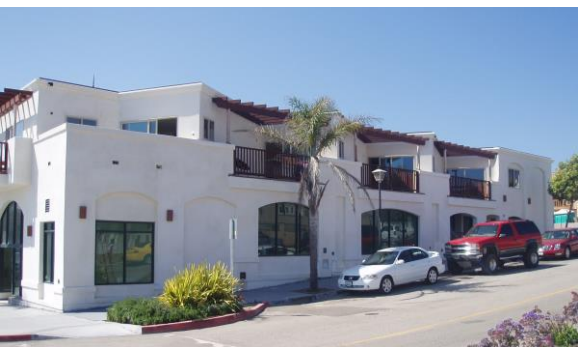
Front Street Mixed Use - Avila Beach, CA

4 residential vacation rental units over commercial retail/office at ground level. Project has onsite underground parking. This project is in heart of downtown Avila Beach and was part of the Unocal rehabilitation of Avila Beach.